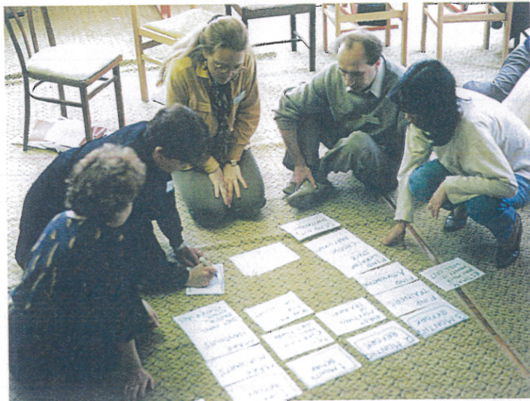
Learning the steps involved in organising a workshop

The staff of the Foundation have done an excellent job in dealing with the substantial increase in our work. Their thoroughness and care for detail whilst maintaining increasing output has been impressive. The workload continues to grow and staff are fully stretched managing up to 90 projects each at certain times during the year as well as fulfilling their other