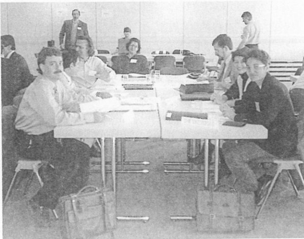
"Young Cypriots Symposium" for Greek and Turkish Cypriots in November 1994

The Foundation is an independent body which gives cash grants, direct or through UK-based organisations, to promote the development of pluralist democratic institutions in emerging democracies. The record of projects listed later in this report shows the range of organisations to which we have given assistance: our aim is to help them assert the right of citizens to play a