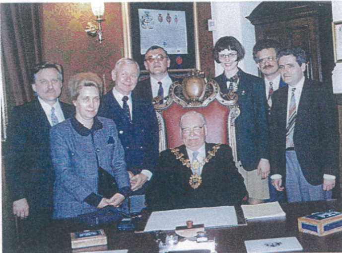
Participants in Polish Union of Labour training course, February 1995

our resources in CEE, 20% in FSU, and 20% in Anglophone Africa. Having set priorities, the Foundation remains flexible and does not exclude highly worthwhile projects in other areas, and we allow 10% funding for non-priority regions. We focus on political education and preparation for elections, on legal and media issues, and on women's and trade union groups, but we remain willing to respond to urgent requests wherever the need is clear and where the Foundation can be seen to make a difference. There is no one set of conditions which will guarantee successful political transformation, and we must be able to respond quickly to rapidly changing political situations.