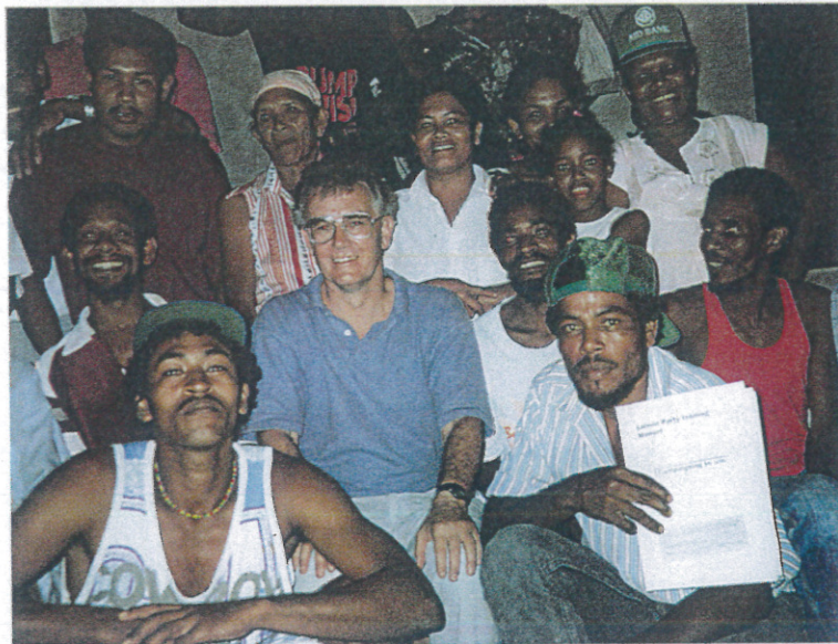
Participants from the Carib territory in Dominica receive party training in February 1995

This area of political development is fraught with difficulty, and from the start – encouraged by the Government and the Foreign and Commonwealth Office – we have taken risks. We knew there would be disappointments: there is no way of predicting winners in the democracy steeplechase. Nevertheless, the Board is convinced that in just three years the Foundation has made a solid contribution to democratic development overseas.