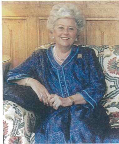
The Speaker of the House of Commons