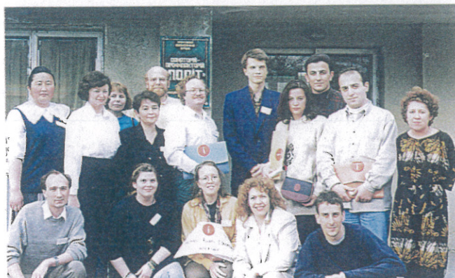
Kharkiv Human Rights Education workshop in Ukraine, organised by Amnesty International in April 1995

Where possible, the Foundation works jointly with other bodies either in funding or in organising and managing projects. Recognising that democracy may take a variety of forms, we have not limited ourselves to the presentation only of the Westminster model, and have worked with other democracy funders, for example the US National Endowment for Democracy (and its core grantees) and the German Stiftungen, to provide a broad range