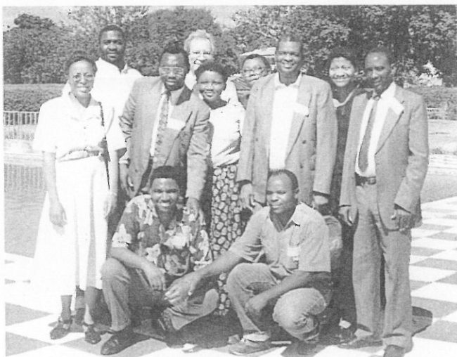
Political party training workshop in Zambia, March 1995

The Westminster Foundation has just completed its third year. This report highlights its achievements and lists the range of projects supported in 1994/95. It is an impressive list and a tribute to the Foundation that it has