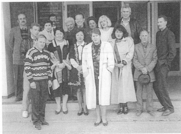
Assessment visit for the independent trade unions in the Republic of Kazakhstan, March 1995

Evaluation of projects continues to present challenges. Criteria for evaluation are elusive and country-based independent evaluators are not always forthcoming, but we have established a set of performance indicators for judging the likelihood of projects fulfilling their objectives and a set of criteria to help us to evaluate projects once they are completed. At every point, rigorous control is exercised over costs. We are determined that the