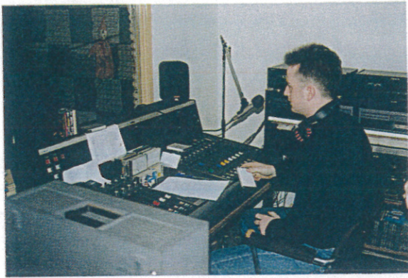
Independent broadcasting from Radio Kameleon, Bosnia

This may have been a year of enormous activity but it has also been a year of inspections. As well as the routine accounts audit, which I am pleased was fully satisfactory, we have had two management audits: on strategic planning and (particularly helpfully) on project management, and we are currently in the middle of a fundamental review of our complete operation.