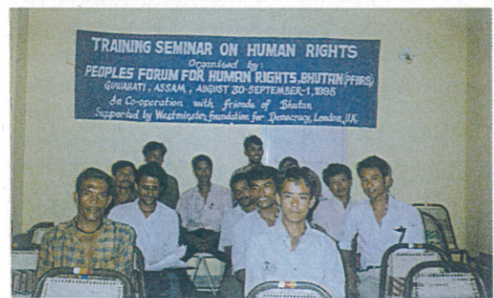
Training for Bhutanese refugees in India on human rights issues.

The Labour Party in particular have continued to support political development projects in Cameroon, Zaire, Guyana and Chile, and several countries of the Caribbean where they have good relationships with sister parties. An increasing number of proposals have been received from Palestine, Latin America, Sri Lanka and other parts of Asia, and these suggest a possible future trend for the Foundation's work in the years to come. The political parties are also beginning to explore work in some of these countries, where they have existing partners who are in need of support.