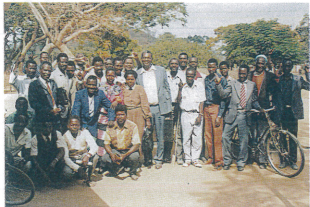
Political party training in Zambia, August 1995

The Foundation has also encouraged cross party projects such as the programme for training party workers in Ghana in preparation for forthcoming elections. Both participants and UK trainers came from across the political spectrum, and as one participant remarked about the Conservative, Labour and Liberal Democrat trainers: 'they not only work well together, they even travelled out on the same aeroplane'.