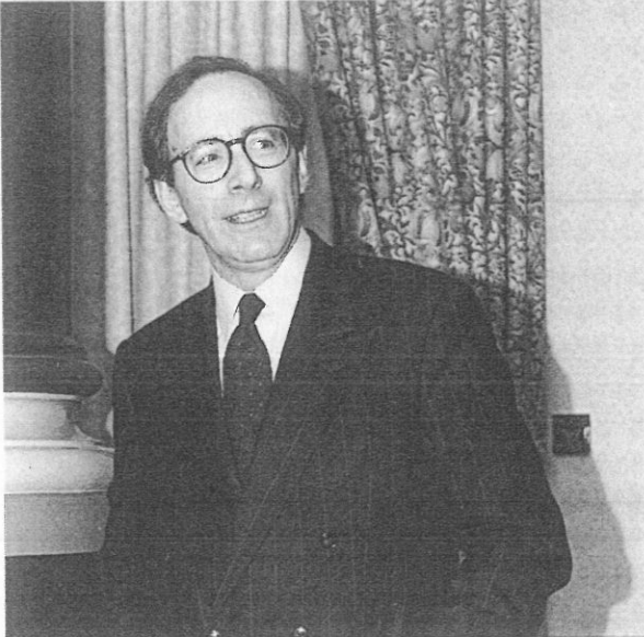
The Foreign Secretary addresses the International Foundations Conference, February 1996.

“Britain must take a lead role in encouraging civil society and democratic development around the world: the Westminster Foundation has enabled us to do this in many countries and I am particularly pleased that it has achieved so much in Bosnia, a country close to my own heart.”