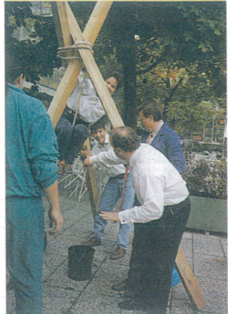
Leadership training seminar for Slovene Christian Democrats, carried out by the Conservative Party.

In former Yugoslavia, emphasis has been placed on supporting the independent media with some human rights and NGO development. Projects have included providing legal assistance to the independent media, supporting 'Feral Tribune' and 'Radio Ozalj' in Croatia; running an NGO management seminar and human rights seminars in Serbia, and providing equipment for 'Radio Bajina Basta' and newsprint for 'Ekonomaska Politika' also in Serbia. The Foundation's work in Bosnia is of supreme importance following the Dayton Peace Accord and its support for the liberal multi-ethnic parties there is widely praised. It has also put substantial resources into supporting the independent radio, television and print media.