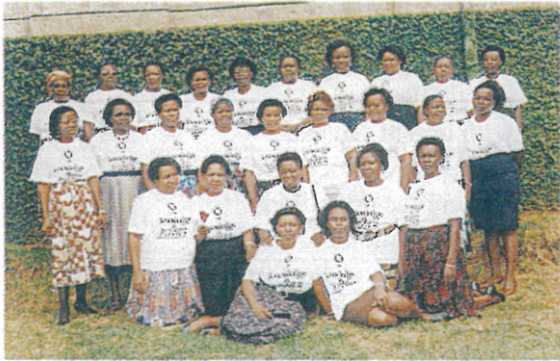
Knowledge is Power: Kenyan Women Workers Organisation leadership training workshop, June 1995.

Demand for grants for projects in Anglophone Africa continues to grow beyond the available resources of the Foundation, and this will no doubt continue to be the trend as donors from other countries concentrate elsewhere. It is vital that the Foundation maintains a strong presence, particularly in Commonwealth countries, where it has now established a good reputation and a good track record of projects.