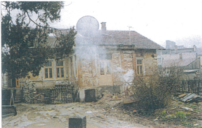
Radio Kameleon studio, in war-torn Tuzla, Bosnia