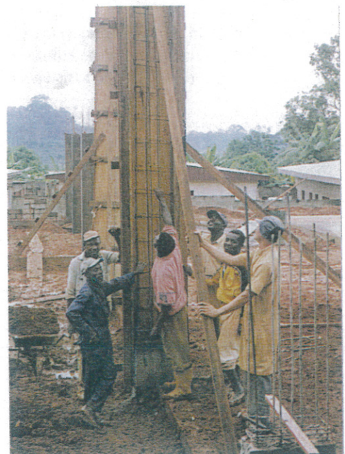
Building offices for 'The Herald' Newspaper, Cameroon

It is important to continue and expand the Foundation's work in a region still in a state of political flux, where the foundations for civil society are fragile and democracy has yet to take root.