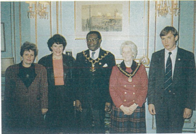
Local government and NGO representatives from Voronezh, Russia, with the Sheriff of Nottingham during a local government study tour.

During the year the Foundation has worked predominantly with the countries in the European zones of the former Soviet Union, notably Russia, Belarus and Ukraine, though it has also been involved with projects in the Trans-Caucasus (Azerbaijan, Georgia, Dagestan) and, to a lesser degree, in Central Asia and Mongolia.