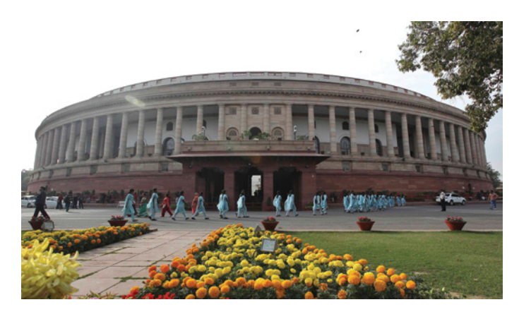
4.4. Indonesia: Committee on Legislation and Centre for Post-Legislative Scrutiny

The PAC itself examines the reports of the Comptroller and Auditor General (CAG) of India. While PAC members often complain that its recommendations are not heeded by the ministries, the PAC itself has several features which do not contribute to institutional strength, such as membership of PAC for varying timespans (from one year to the full term of parliament), procedures of PAC are left to the chairperson to decide, and lack of consistency in following up on subject matters included in the agenda of the PAC.<sup>25</sup>