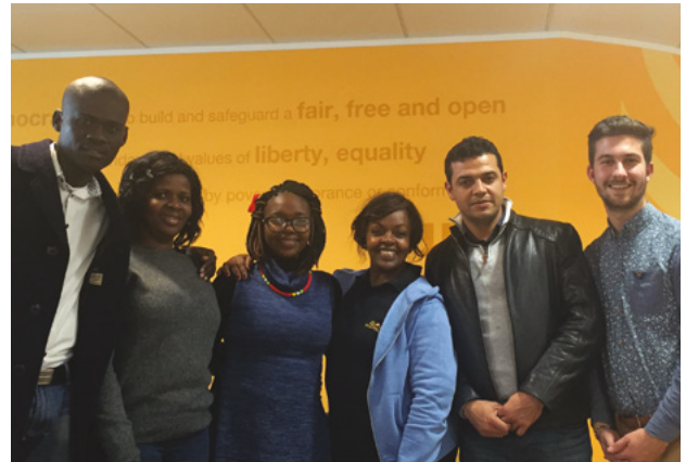
Representatives from the Africa Liberal Network participate in the Youth Academy 2017

Political networks for young people have also made a difference in the region in 2016-17. The Africa Liberal Network established the Youth League, following regional elections for a new Committee and the Labour Party continued to work with the Youth Academy for Africa.