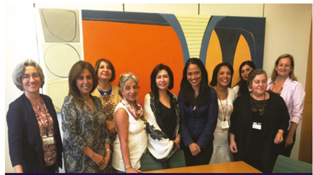
Tha'era network meet with the Vice-Chair of WFD's Board of Governors, Rushanara Ali MP

The SNP started exploring ways to support the Ra'edat, the Arab women's parliamentary network, to undertake cross-border work with female politicians, youth groups and current leadership to raise awareness of the problems faced by women and other marginalised groups.