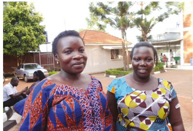
District Councillors from Gulu, Uganda

Supporting the needs of women in Uganda remains a focus of our programming in the country, but with 82% of the population under the age of 30, our work has expanded to promote youth engagement with a focus on girls and human rights.