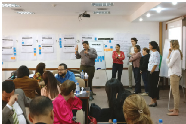
Workshop with the Research Department of the National Assembly of Venezuela

In Venezuela , WFD worked closely with the National Assembly to strengthen the work of the Research Department as it supports MPs. Legislation relating to Climate Change, Access to Information and the Rule of Law were discussed whilst efforts were made to engage the public and civil society more in the Assembly's work through the development of a draft Open Parliament Strategy.