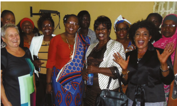
The Women's Academy for Africa is supported by the UK Labour Party

Participants from the Women's Academy for Africa, the Arab Women's Network for Parity and Solidarity, Tha'era, and the CEE Gender Network for Eastern Europe and the Western Balkans met with UK Labour Party politicians and women activists ahead of International Women's Day 2017 to share best practice and identify areas of support.