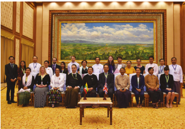
WFD MOU signing with the Assembly of the Union in Burma

In Burma , WFD manages a significant Department for International Development (DFID) programme in partnership with the UK House of Commons that was launched in January 2017. WFD began developing a pilot programme simultaneously at the sub-national level to encourage better dialogue between the central and provincial legislatures.