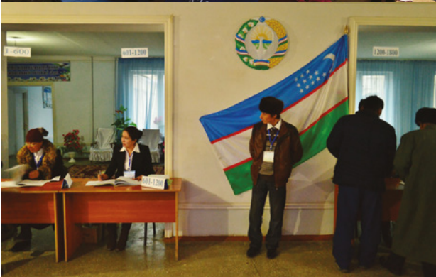
Elections in Ghana and Uzbekistan took place in December 2016 - WFD recruited UK observers for the EU and OSCE election observation missions