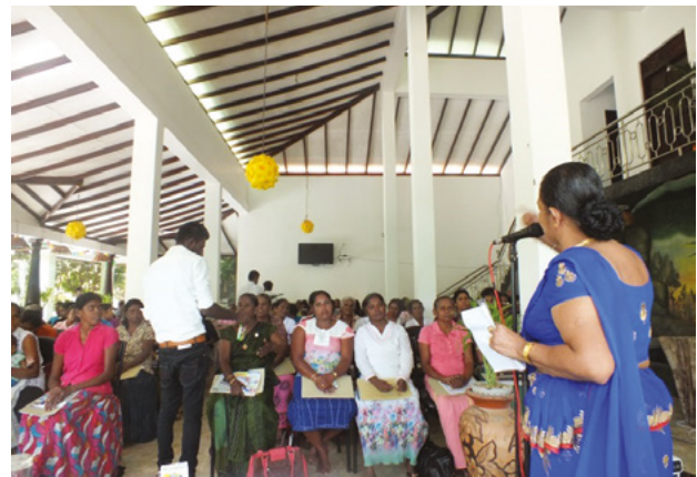
Prospective women candidates attend WFD workshop ahead of local elections in Sri Lanka

Running in parallel to our work with political parties, WFD is providing support to the on-going constitutional and parliamentary reforms taking place in Sri Lanka following the election of the new government in 2015, with specific support to oversight committees.