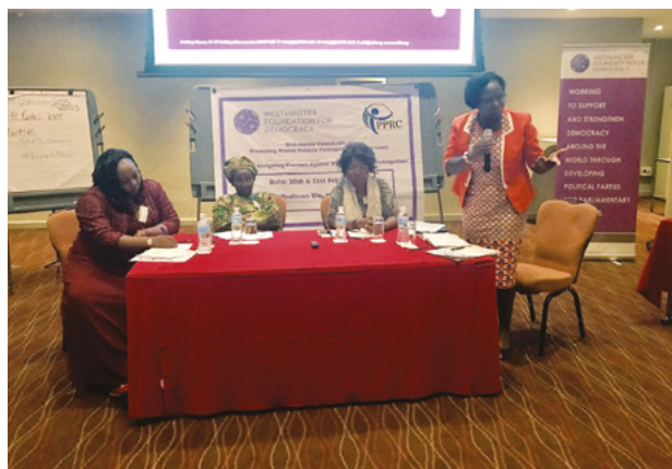
Round table discussion on women's participation in Sierra Leone

WFD joined a consortium, led by Search for Common Ground, to support marginalised groups such as women, young people and people with disabilities ahead of the general election planned for 2018.