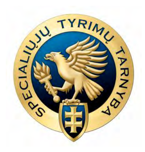
Figure 1: Logo of Special Investigation Service of the Republic of Lithuania

The tasks of the SIS are to perform, in accordance with the procedure established in the laws and other legal acts, criminal persecution due to corruptionrelated crimes, criminal intelligence, corruption prevention, anti-corruption education of the public and public awareness raising, analytical anti-corruption intelligence and other tasks assigned to the SIS in the laws and other legal acts.<sup>30</sup> Furthermore, the Law on Prevention of Corruption stipulates that the SIS: (1) participates in the development of the National Anticorruption Programme by the Government and make proposals as to the supplement or amendment of the said Programme; (2) makes proposals to the President of the Republic, the Seimas and the Government as to the enactment, supplement and amendment of laws and other legal acts necessary for the implementation of corruption prevention; (3) takes part in the functions of