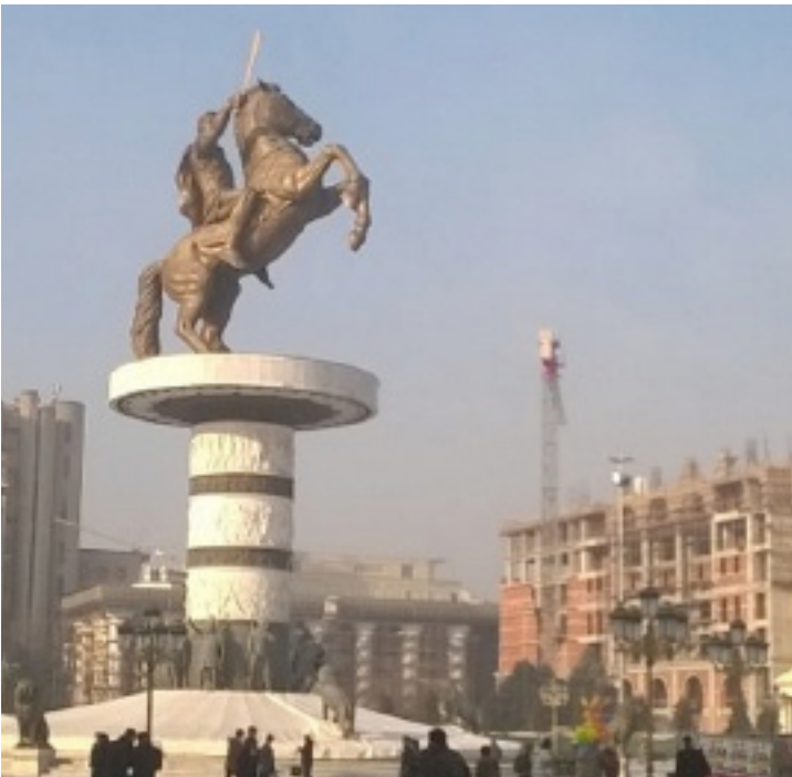
Macedonia Square, Skopje

Staff should be employed directly by parliament, and not be on secondment from the Government (e.g. the legislative drafting office) or NGOs, so that the reports and findings of the parliamentary human rights committee are seen to be independent from both. All six parliamentary human rights committee studied met this principle.