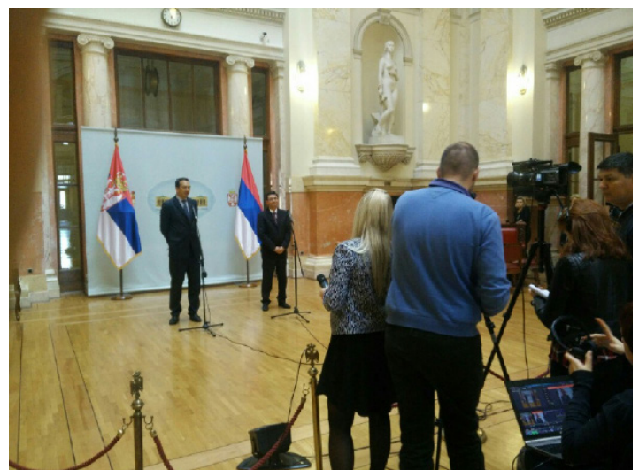
Anthony Smith, WFD CEO launches Parliamentary Budget Office in National Assembly for the Republic of Serbia

Against Women (CEDAW) and its Optional Protocol. The UN CEDAW Committee has also issued a statement setting out a number of ways in which parliamentarians can participate in its work. 11 It may also be instructive to consider the UK case study below, which presents the advantages and disadvantages of two forms of scrutiny: holding major inquiries on the state's record under main international human rights treaties, and inclusion of relevant treaties and recommendations into its general work programme