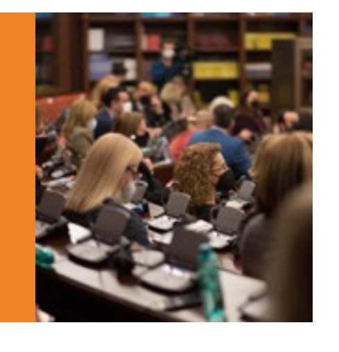
Women's political leadership

Democratic action on climate and the environment